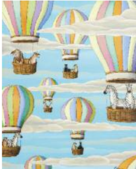
Exodus 24 x 30" A/B 133020