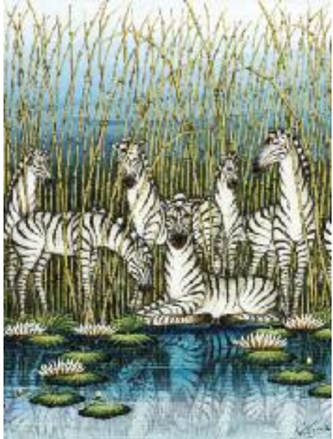
Bamboo Bank 12 x 9" A/B 133011