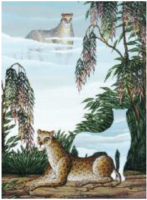
Absence II 13 x 9" A/B 130315