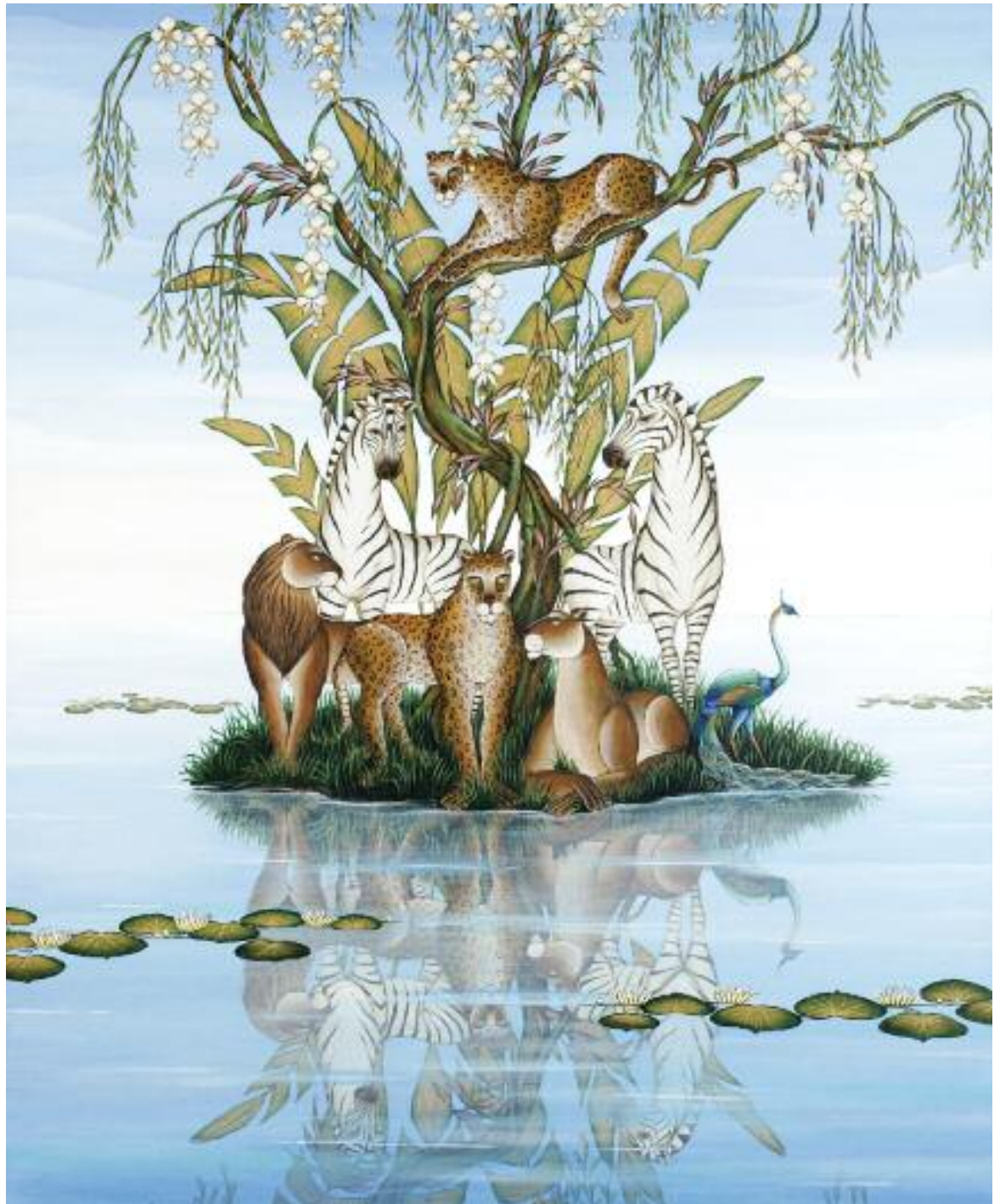
The 7th Resident, 48 x 36", A/C - 133027