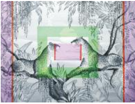
Full Moon Ritual 30 x 40" A/C 133023

“Sometimes, I think of myself as a black panther trapped in the body of a well-traveled painter!”