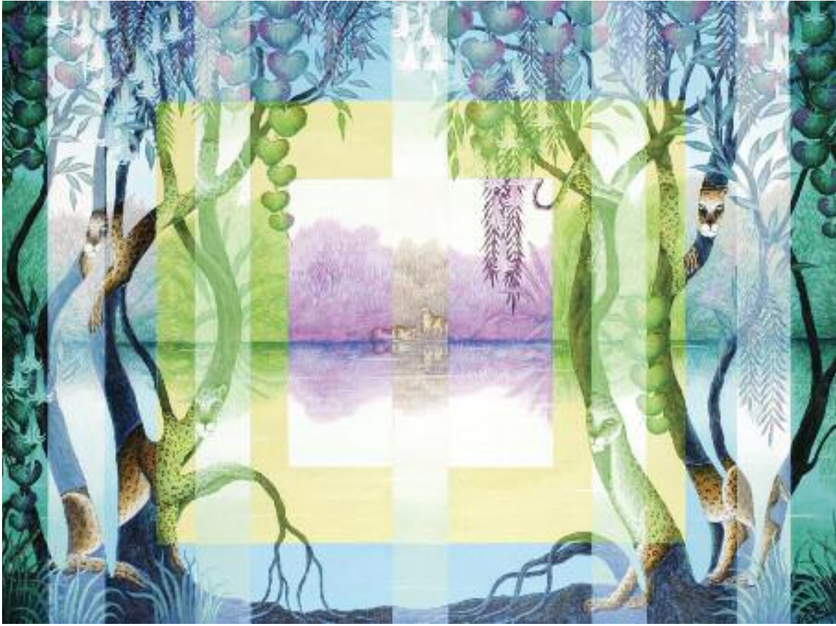
Virtual Forest 36 x 48" A/C 129307