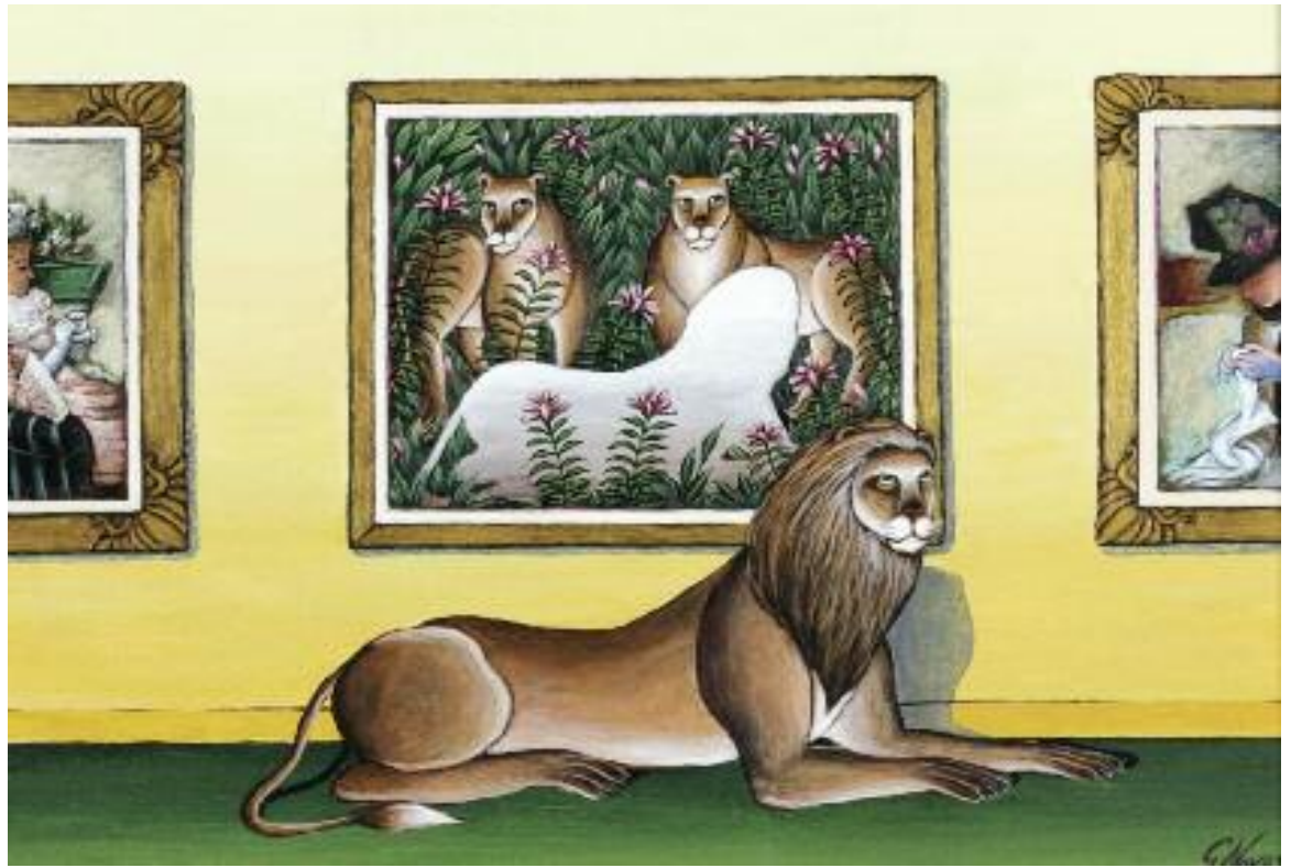
Posing with Mary Cassatt 9 x 13" A/B 130317

The Zoological Society of the Palm Beaches exists to protect wildlife and wildlife habitat, and to inspire others to value and conserve the natural world. We advance our conservation mission through programs in field research, endangered species propagation, education, health and wellness, and conservation medicine. Our sustainable and responsible business practices and local, national and global partnerships enable the Palm Beach Zoo to support global conservation, species survival, and habitat preservation.