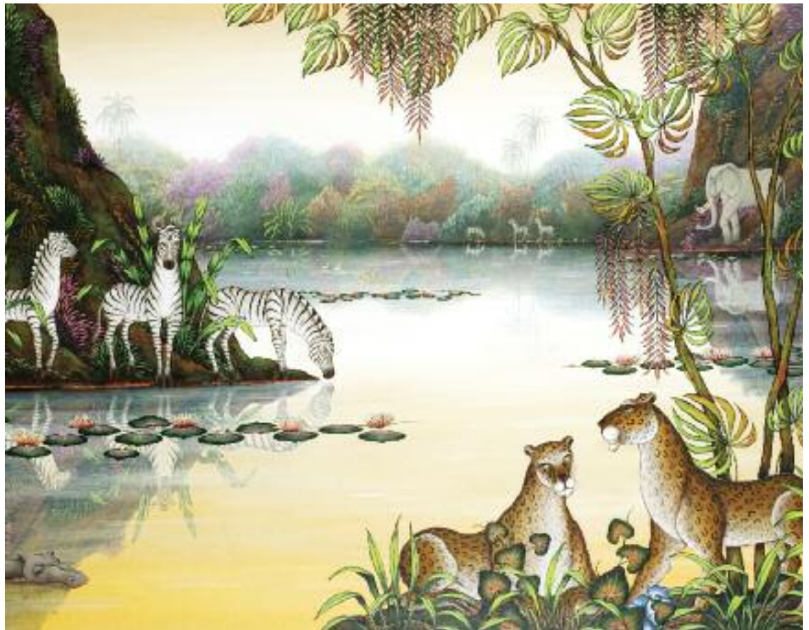
Surprising Paradise 36 x 48" A/C 133028

Panthera was founded in 2006 with the sole mission of conserving the world's 36 species of wild cats. Utilizing the knowledge and expertise of the world's top cat biologists, Panthera develops, implements, and oversees range-wide species conservation strategies for the world's largest, most imperiled cats – tigers, lions, jaguars and snow leopards. By working through partnerships with local and international NGO's, scientific institutions, and local and national government agencies, Panthera has brought together a critical mass of passion, expertise, and large-scale strategic thinking.