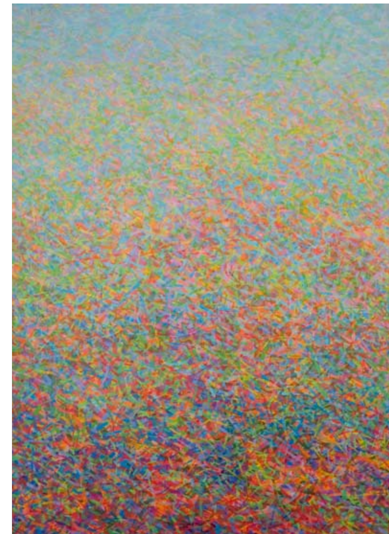
A THING OF BEAUTY, 1982, 72 X 52 IN., O/C - 133447