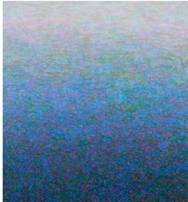
EYE SCAPE, 1983 - 84, 66 X 60 IN., O/C - 133440