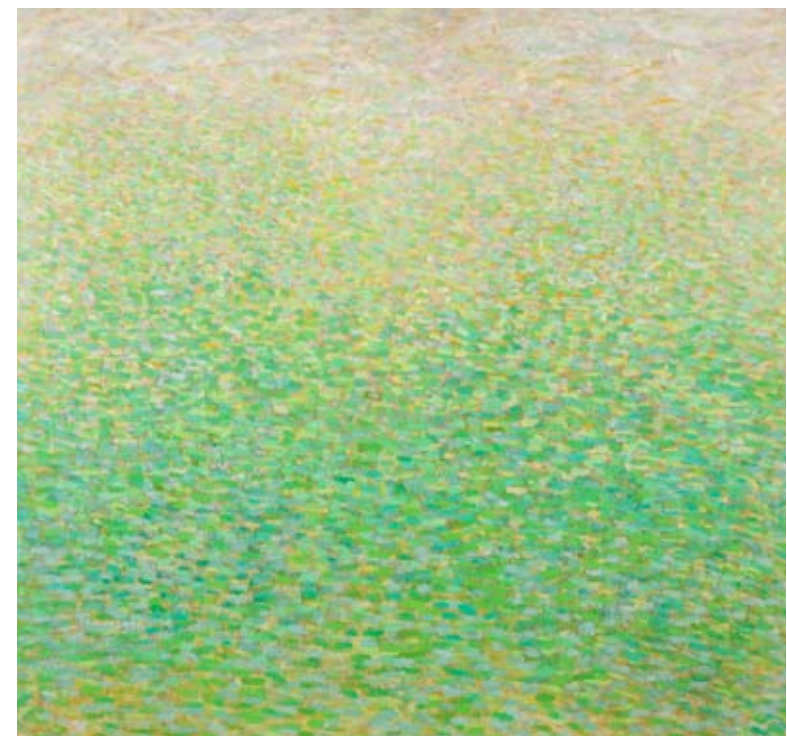
UNTITLED, 1975, 48 X 51 IN., O/C - 133388

FROM THE BOOK "LEONARD NELSON" BY SAM HUNTER