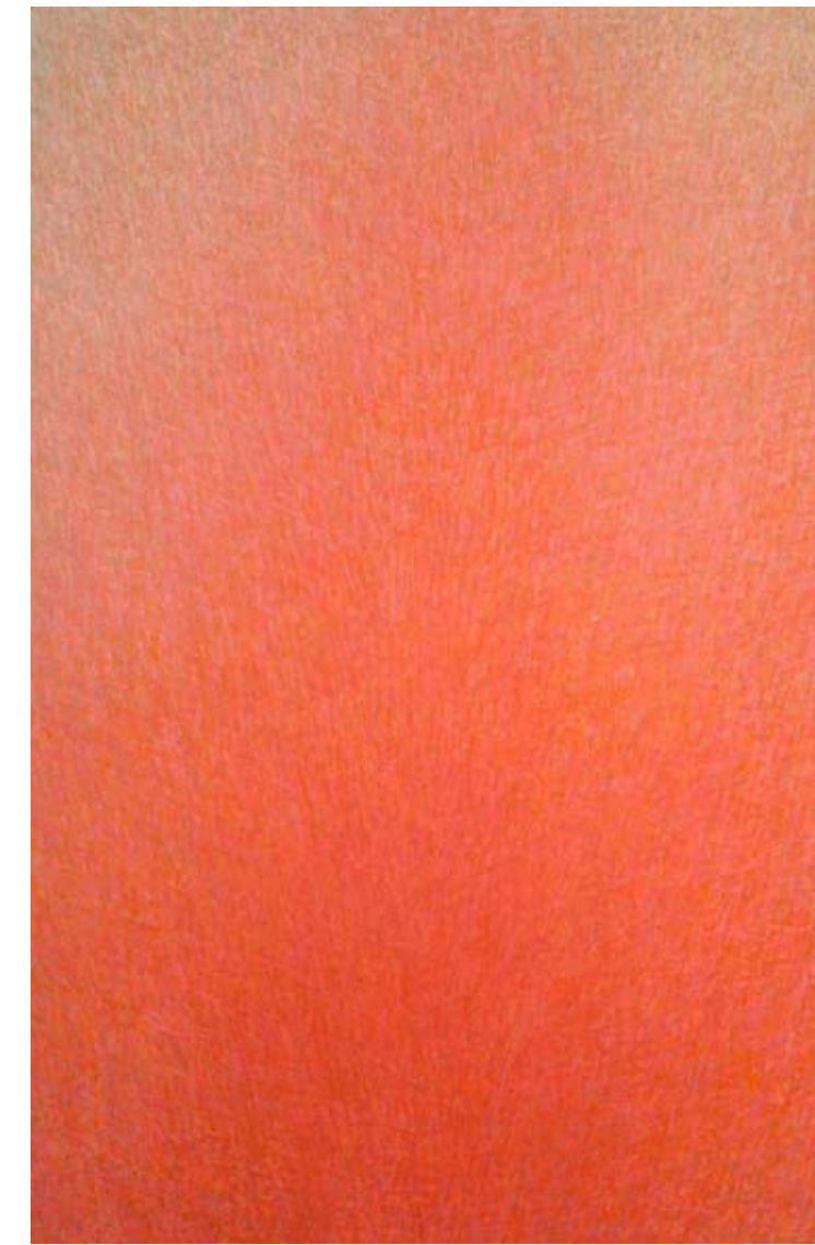
UNTITLED, 1976, 72 X 48 IN., O/C - 133395