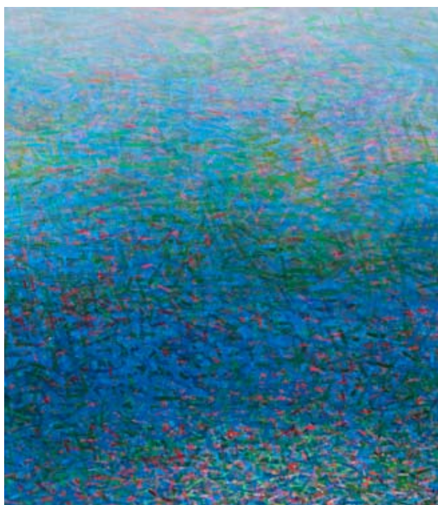
THE JOY OF LIFE, 1984 - 85, 60 X 52 IN., O/C - 133452