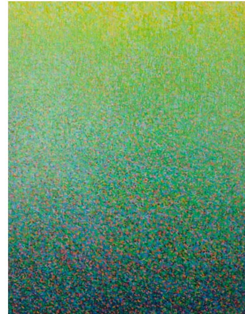
PLEASURE GARDEN, 1981, 78 X 60 IN., O/C - 133446