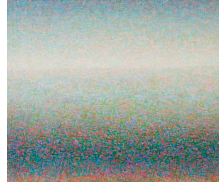
SOMEDAY NEVER COMES, 1980, 50 X 60 IN., O/C - 133417