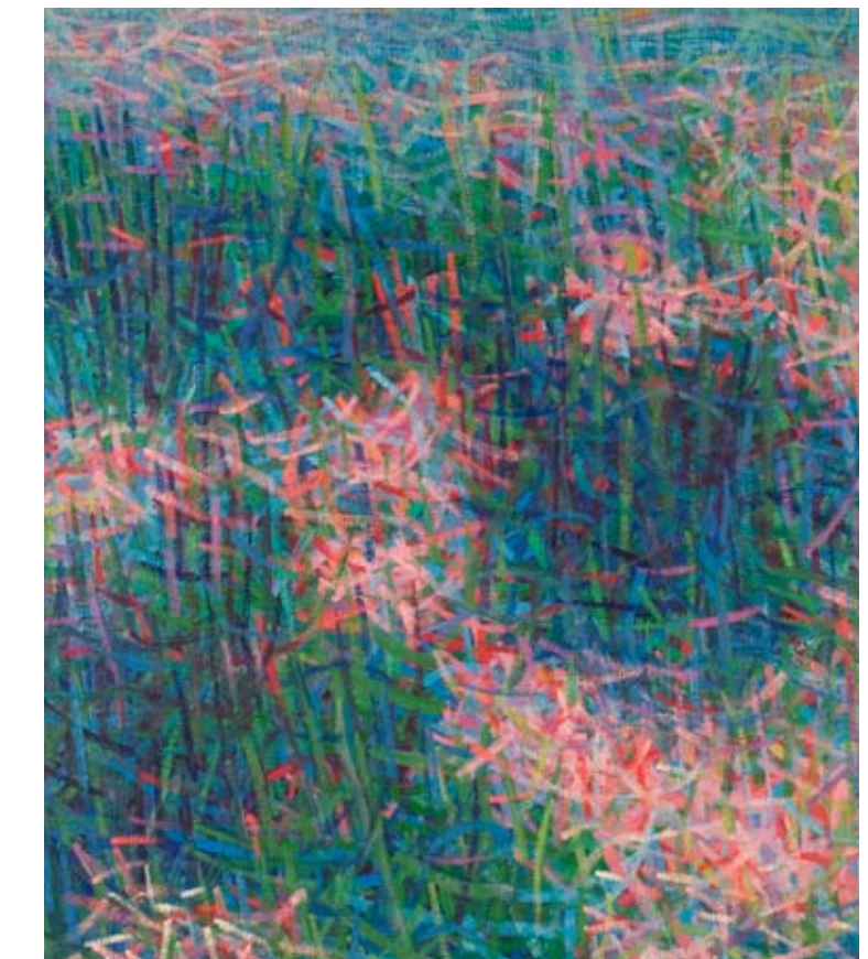
UNTITLED 1985 - 86, 50 X 44 IN., O/C - 133425