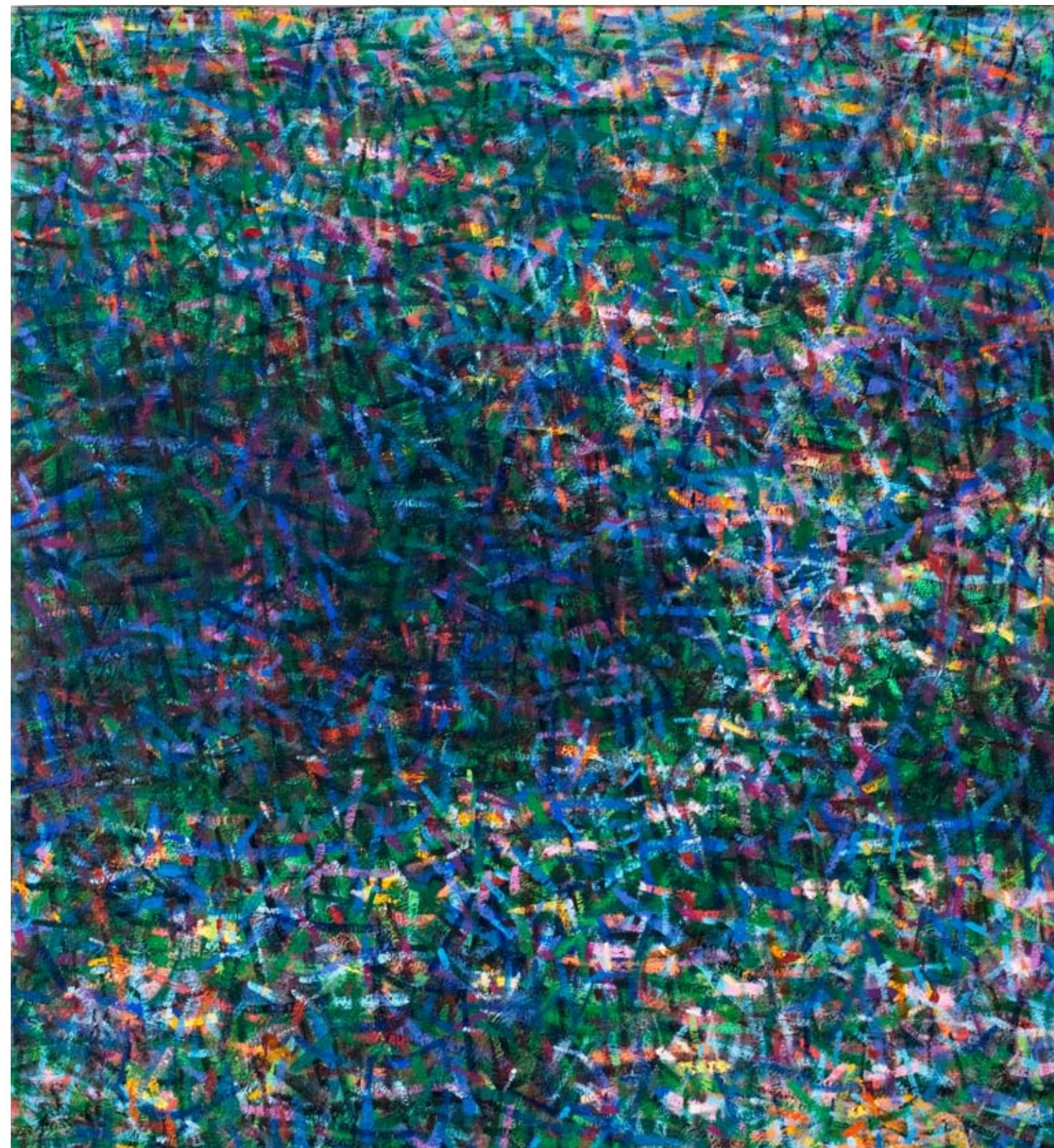
A FLOWER IS A FLOWER, 1986 - 87, 52 X 48 IN., O/C - 133430

"..IN THEIR LARGE SCALE, RICH TONALITIES AND ACTIVE RICHLY PATTERNED SURFACES, THEY SUMMARIZE IMPORTANT ASPECTS OF THE COLORFIELD ABSTRACTION GENRE, AND, OCCASIONALLY, TRANSCEND IT."