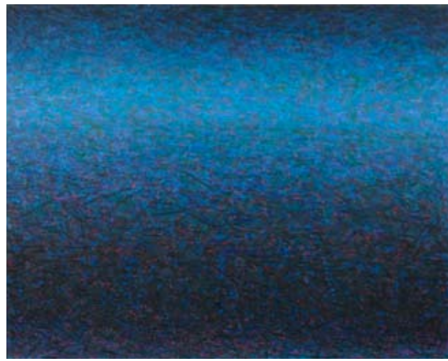
NITE FALL, 1980 - 81, 48 X 60 IN., O/C - 133441