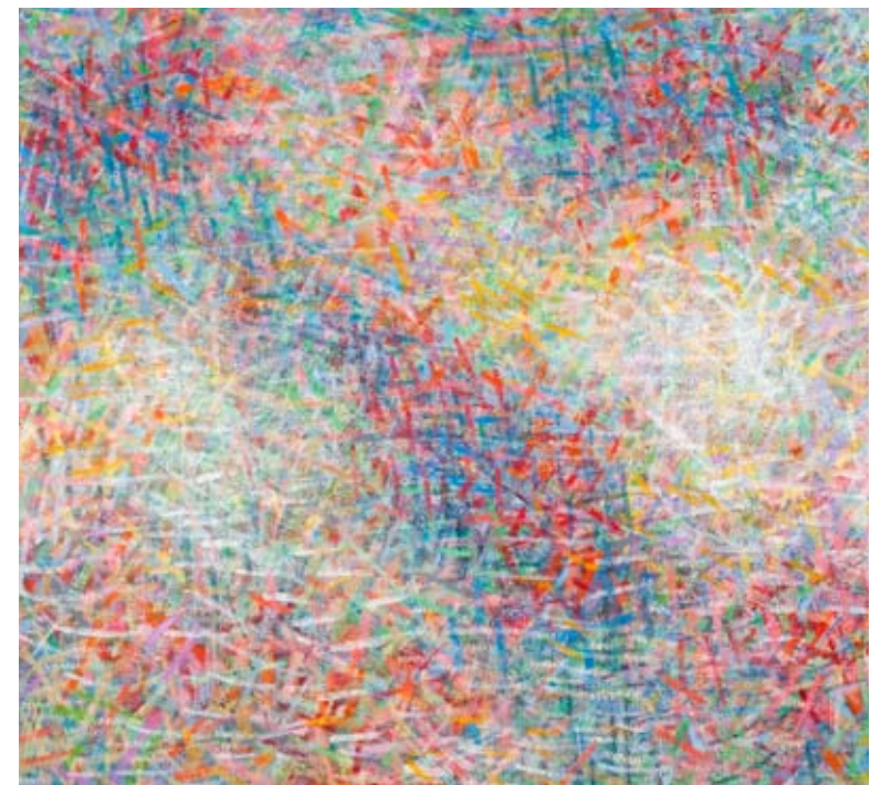
UNTITLED, 1988 - 89, 46 X 50 IN., O/C - 133415

PLEASE CONTACT GALLERY FOR AVAILABILITY.