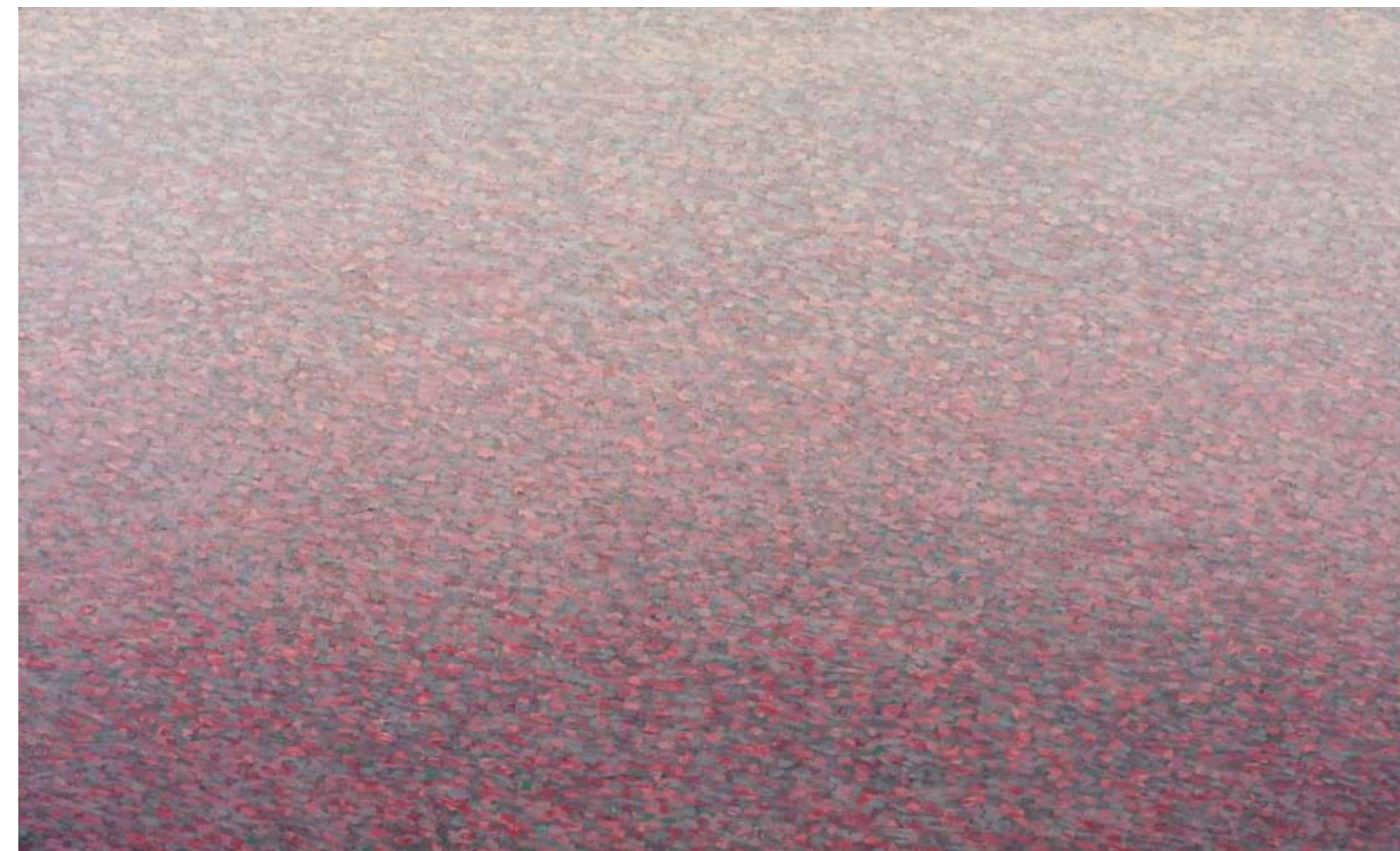
UNTITLED, 1974 - 75, 48 X 72 IN., O/C - 133394