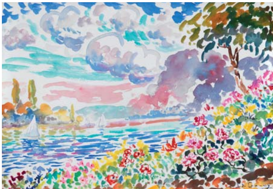
LE JARDIN DE NATHALIE - 7 X 10 IN., WATER COLOR ON PAPER