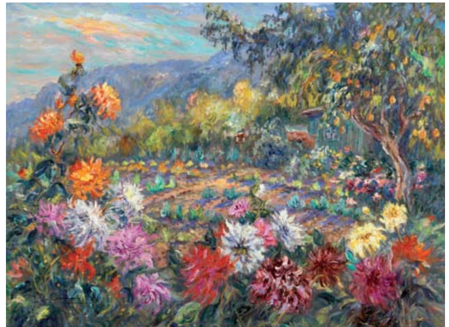
CABANE AU JARDIN - 28 x 36 in., OIL ON CANVAS