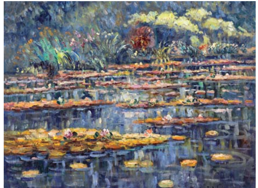
NYPHEAS A GIVERNY - 14 x 18 in., OIL ON CANVAS