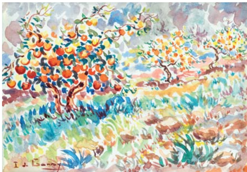
ORANGERS - 4.5 X 6.5 IN., WATERCOLOR ON PAPER