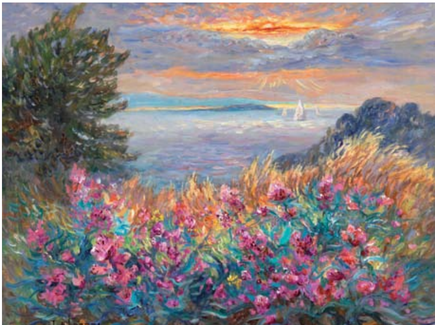
POIS DE SENTEUR SAUVAGES - 23 x 28 in., OIL ON CANVAS