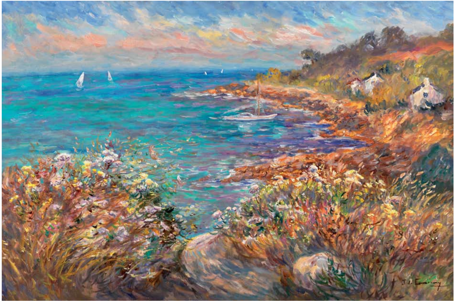
PLAGE DU VAL AU SAIRE - 23 X 36 IN., OIL ON CANVAS