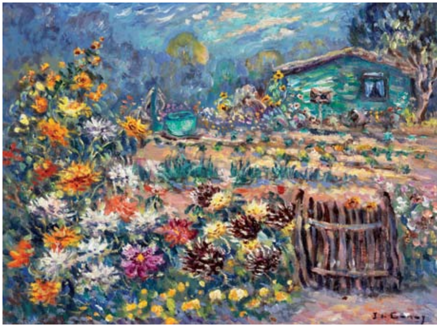
PETIT POTAGER - 10 x 13 in., OIL ON CANVAS