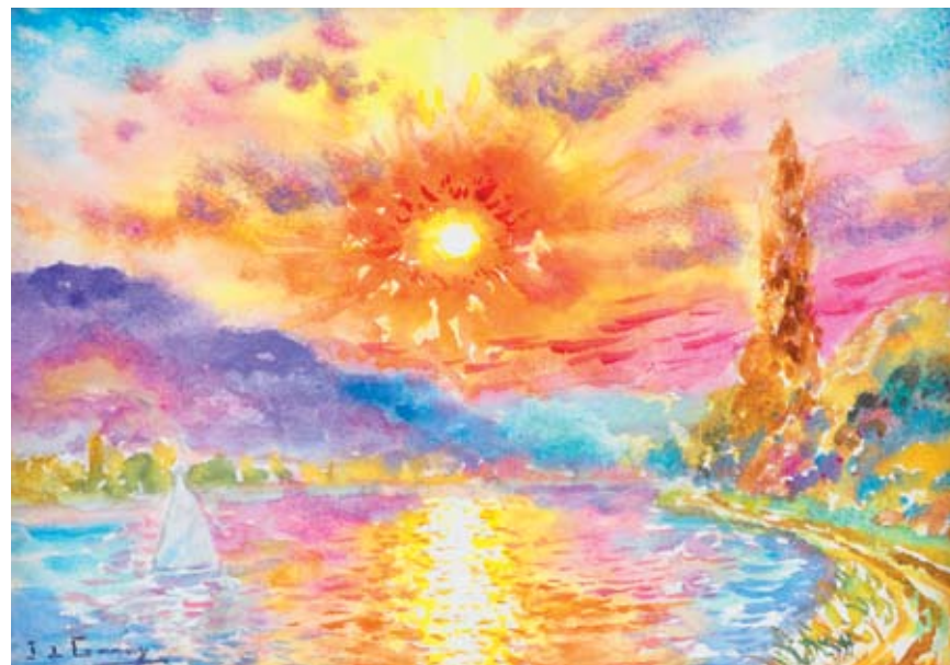
LE COUCHANT - 7 X 10 IN., WATERCOLOR ON PAPER