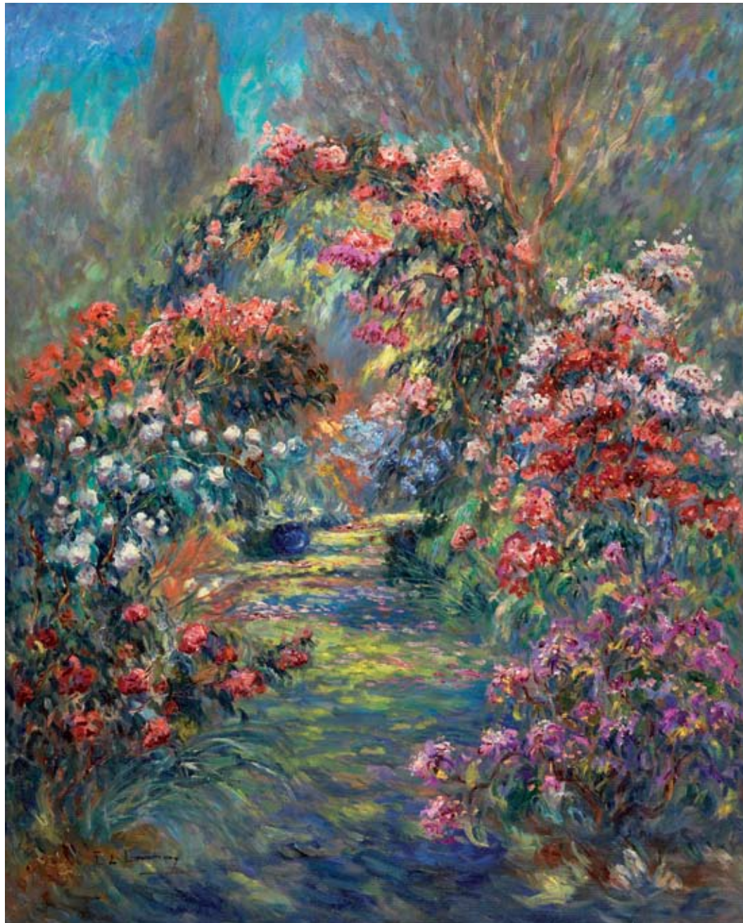
JARDIN DE ROSES - 36 x 28 IN., OIL ON CANVAS